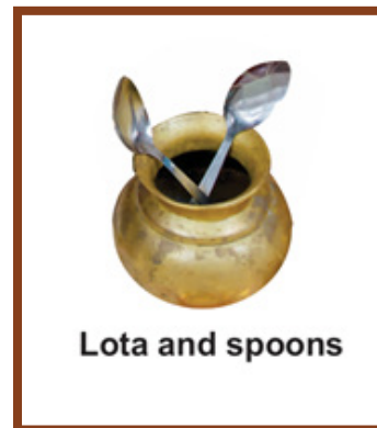
Lota and spoons